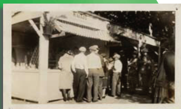
Kutol at trade show in 1931