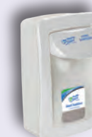
SS001WH33HS MANUAL White/white