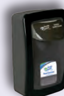
SS001BK31HS MANUAL Black/black