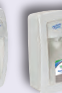
MS016WH33HS M-Fit NS011WH33HS NO TOUCH (automatic) White/white