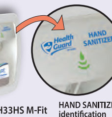
HAND SANITIZER identification