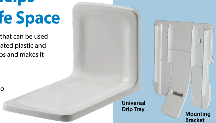
Universal Drip Tray

The Universal Drip Tray can be used in restrooms, kitchens, hallways, waiting rooms or wash stations. Simply install a drip tray beneath any dispenser located on a wall or one of our floor stands.