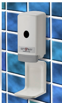
Soft & Silky