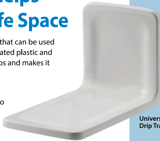
Universal Drip Tray

The Universal Drip Tray can be used in restrooms, kitchens, hallways, waiting rooms or wash stations. Simply install a drip tray beneath any dispenser located on a wall or one of our floor stands.