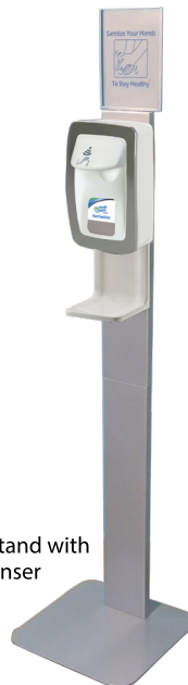
Freestanding Floor Stand with No Touch Dispenser