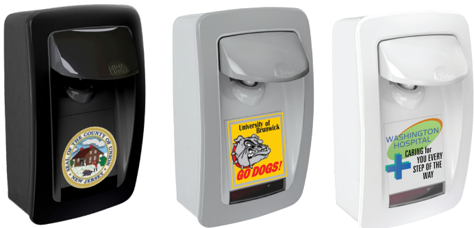
Black with black Trim/Push Pad