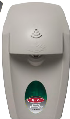
No Touch (Dove Gray)