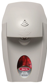
No Touch M-Fit

Customer cost: $75 printer plate charge per color ( this is a one-time charge unless graphics changes are made) Example shown: dark red and black is 2 colors = $150.00 Typically these are printed in 2 or more colors