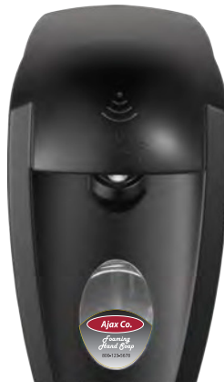
No Touch (Black)

Customer cost: $75 printer plate charge per color Example shown: dark red and black is 2 colors = $150.00 Typically these are printed in 2 or more colors