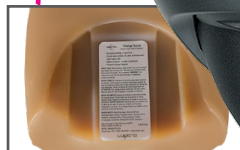
View of back label