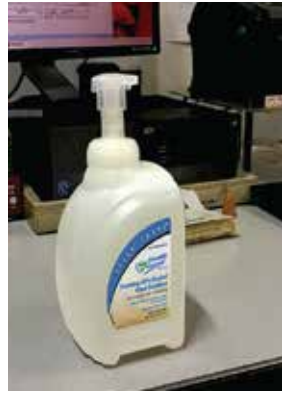
Portable bottles can be placed on desk and counter tops; small bottles are convenient for on-the-qo.