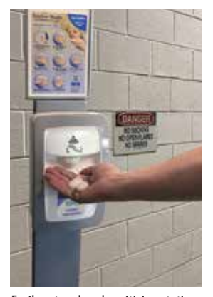
Easily set up hand sanitizing stations with floor stands and dispensers of sanitizer. Use non-alcohol sanitizer in hazard areas.

Health Guard hand sanitizers kill germs when soap and water is not available. Easy, fast and convenient, our 62% and 70% alcohol formulas meet CDC recommendations for hand antisepsis. In hazard areas where flammability must be avoided, Health Guard No Alcohol Hand Sanitizer kills 99.99% of common germs without water and is on-flammable.