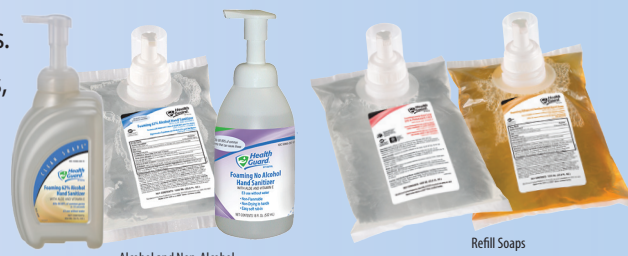
Alcohol and Non-Alcohol Hand Sanitizers