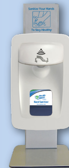
Counter Top Stand