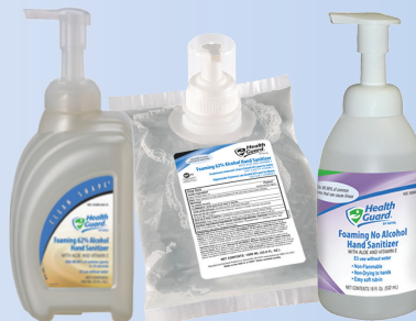
Alcohol and Non-Alcohol Hand Sanitizers