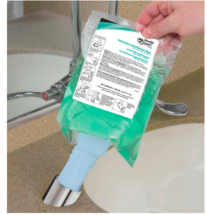
View when refilling