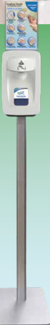
Hand Hygiene Floor Stand Includes Steps to Hand Sanitizing sign (dispenser not included)