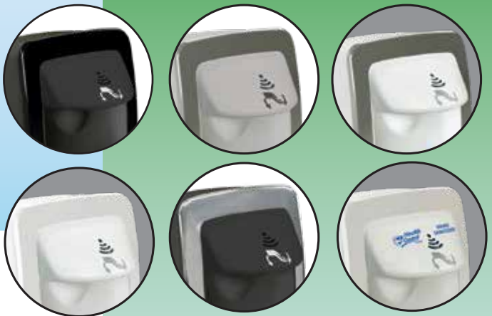
Imprinted with Health Guard Hand Sanitizer

Extended dispensing area for hands to help prevent cross-contamination