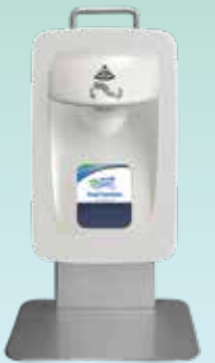
Counter Top Stand (dispenser not included)