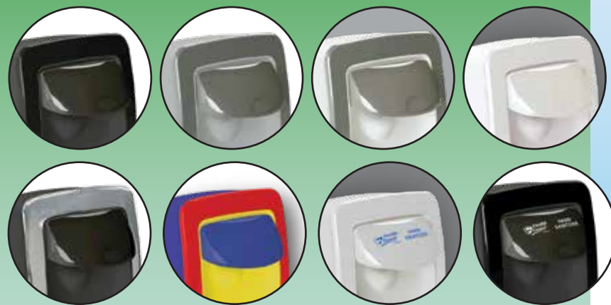
Imprinted with Health Guard Hand Sanitizer