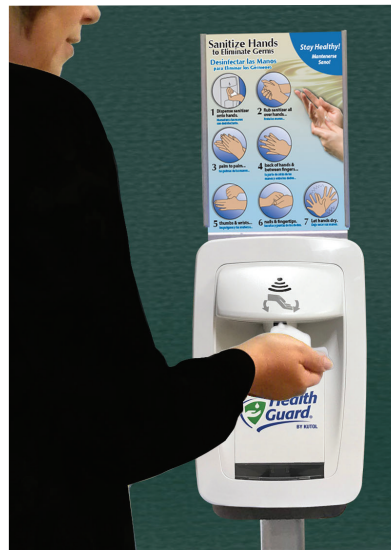
Dispenser shown at standard height