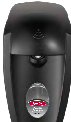
No Touch (Black)

Customer cost: $75 printer plate charge per color Example shown: dark red and black is 2 colors = $150.00 Typically these are printed in 2 or more colors