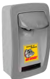
Gray with gray Trim/Push Pad