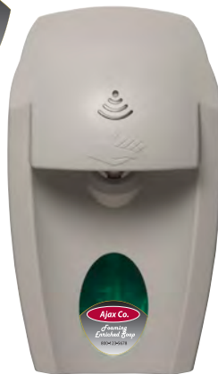
No Touch (Dove Gray)