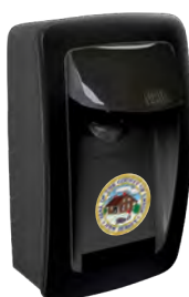
Black with black Trim/Push Pad