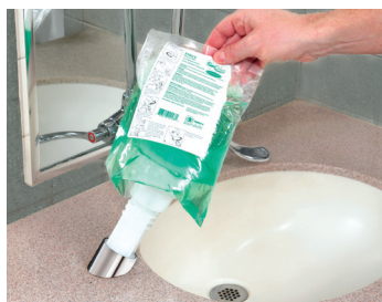
Step 2: Insert bag into the refill dock. The soap will flow by itself into the reservoir below.

Soap will stop flowing automatically, and bag will lock with the remaining product inside, ready for the next use.