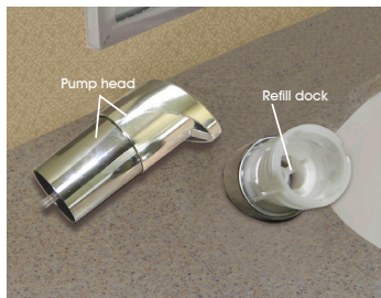
Step 1: Remove the pump head - (no crawling on the floor!)

Refilling is easy - save time, product, and money