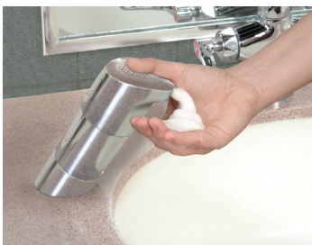
Step 3: Replace the pump. It's ready for use!

Soap will stop flowing automatically, and bag will lock with the remaining product inside, ready for the next use.