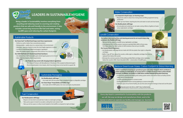
LIT-SUSTAIN Leaders in Sustainable Hygiene