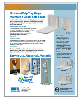
Universal Drip Tray