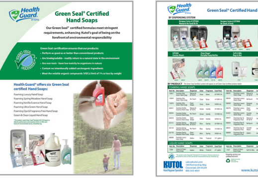
LIT-KGS Green Seal Certified Products