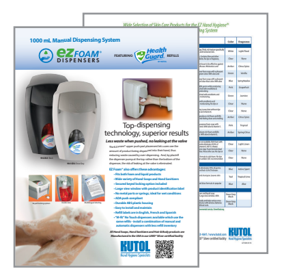
LIT-EZFM EZ Foam<sup>®</sup> Manual Dispensers