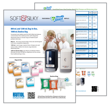
LIT-KSS Soft & Silky Bag-In-Box Dispensers