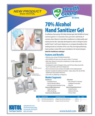
LIT-70HSG 70% Alcohol Hand Sanitizer Gel