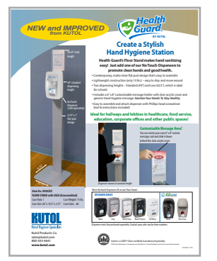
LIT-HHS Hand Hygiene Station