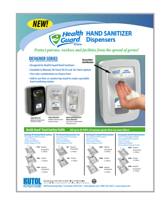
Health Guard Hand Sanitizer Dispensers