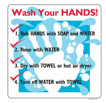
LA380 4" x 4" handwashing sign peel-off, adhesive back