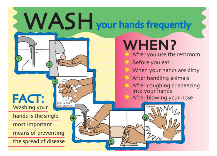
LA139 5" x 7" Handwashing Sign peel-off, adhesive back

Digital PDFs also available on www.kutol.com