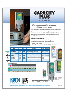
LIT-KCP Capacity Plus Dispensers