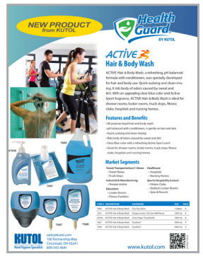
LIT-KACT ACTIVE Hair & Body Wash