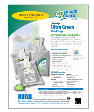
LIT-KUGH Ultra Green Hand Soap