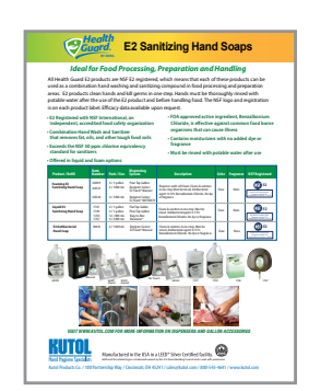
E2 Sanitizing Hand Soaps