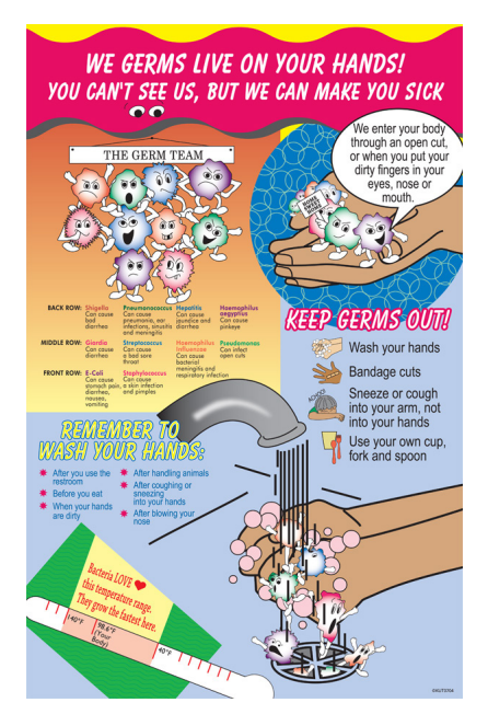
KUT0704 11" x 17" Germs & Handwashing Poster