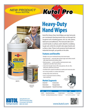
LIT-HDHW Heavy Duty Hand Wipes

Digital PDFs also available on www.kutol.com