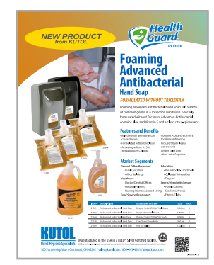
LIT-ADANT Foaming Advanced Antibacterial Hand Soap