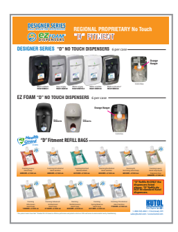
DS & EZ No Touch D Fitment