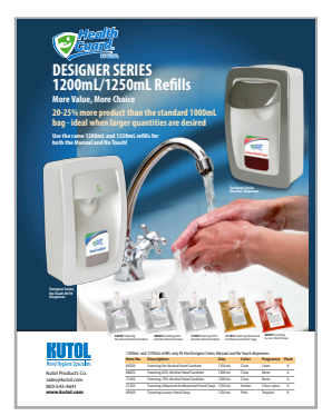
Designer Series 1200/1250 mL Refills