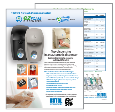
LIT-EZFNT EZ Foam<sup>®</sup> No Touch Dispensers