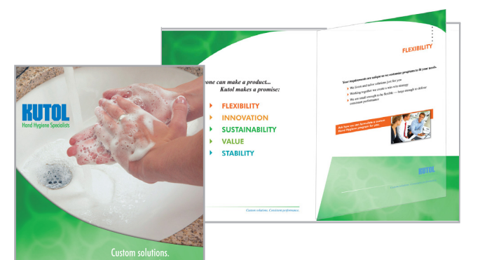
KUTOLFOLDER Kutol Capabilities Folder + Inserts Pocket folder with sales literature inserted into the pocket