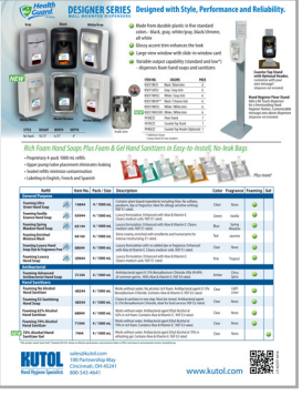
LIT-KDSTF Designer Series No Touch Dispensers