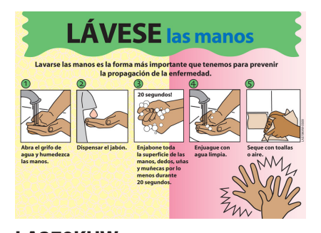
LA379KHW Spanish 5" x 7" Handwashing Sign peel-off, adhesive back