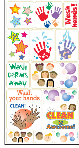
LAM1453E Kid's Faces sticker sheet peel-off and stick onto dispensers to add some fun to handwashing

Hand Sanitizer/Cleaner (rinse with water)