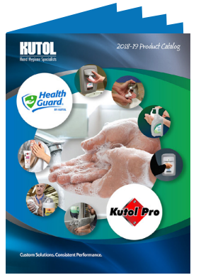
LIT-FLC Kutol Full Line Product Catalog Multi-page brochure

Digital PDFs also available on www.kutol.com