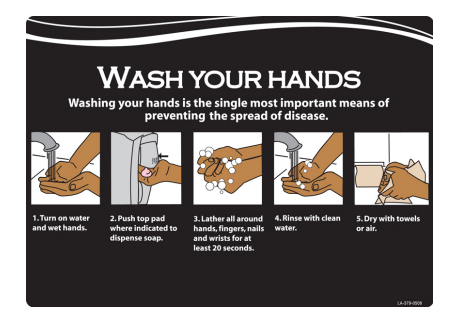
LA379 5" x 7" Handwashing Sign peel-off, adhesive back