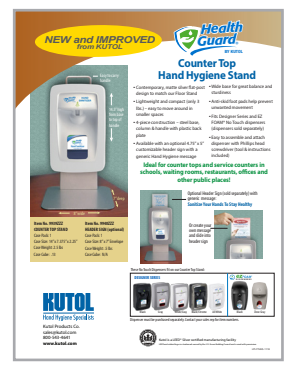
LIT-CTHHS Counter Top Hand Hygiene Stand