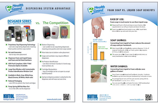
LIT-KVC Health Guard vs. Competition