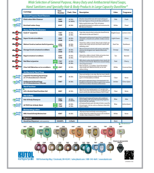
LIT-KDUV DuraView<sup>®</sup> Large Capacity Dispenser