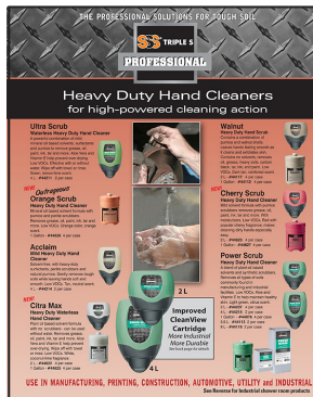
LIT-TSIP (CS-314) SSS Heavy Duty Hand Cleaner 2-sided sell sheet