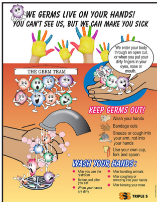
LIT-TSKPOS Kids Germ Poster 8.5" x 11"