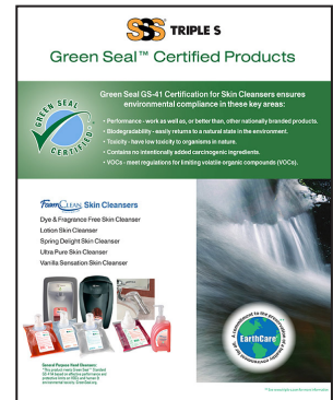
LIT-TSGS (CS-311) SSS Green Seal Brochure 2-sided sell sheet