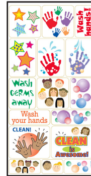
LAM-1453E Kids Sticker Sheet- decorate dispensers or make handwashing posters