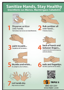
LIT-TSACGS Adult How to Sanitize Your Hands, 5" x 7", English & Spanish Repositionable Cling- also fits into floor stand header