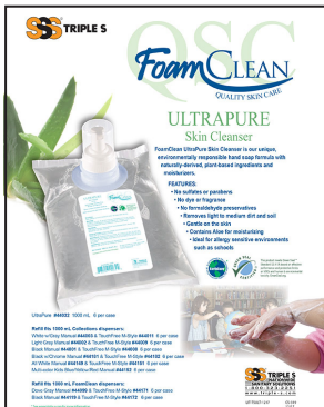
LIT-TSULT (CS-319) SSS UltraPure Skin Cleanser 1-sided sell sheet