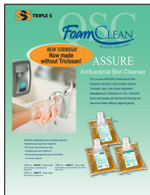
ASSURE No Triclosan Antibacterial Skin Cleanser 1-sided sell sheet DIGITAL ONLY 8.5" x 11"