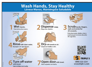
LIT-TSCLING Adult How to Wash Your Hands, 5" x 7", English & Spanish Repositionable Cling