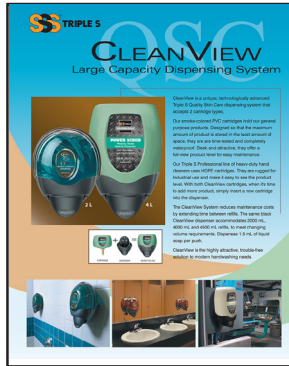
LIT-TSD (CS-307) SSS CleanView Dispenser 2-sided sell sheet