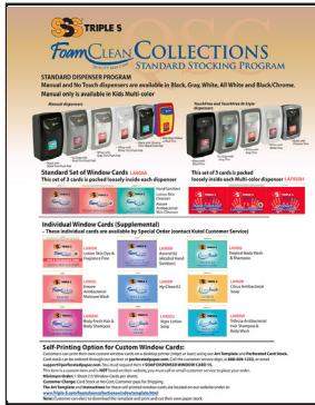
COLLECTIONS Standard Stocking - Dispensers & Window Cards 1-sided sell sheet DIGITAL ONLY 8.5" x 11"