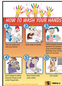
LIT-TSKCGW Kids How to Wash Your Hands, 5" x 7" Repositionable Cling- also fits into floor stand header