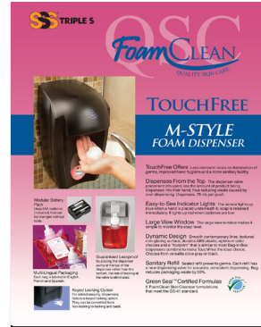
LIT-TSMF (CS-304) SSS Touch Free M-Style Dispenser Brochure 2-sided sell sheet DIGITAL ONLY 8.5" x 11"