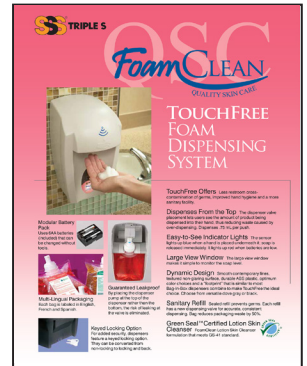
LIT-TSFTF (CS-312) SSS Touch Free Dispenser Brochure 2-sided sell sheet DIGITAL ONLY 8.5" x 11"