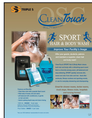
SPORT (CS-324) Hair & Body Wash 1-sided sell sheet DIGITAL ONLY 8.5" x 11"