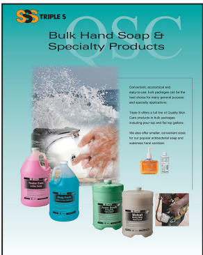
LIT-TSS (CS-309) SSS Bulk Hand Soap Brochure 2-sided sell sheet