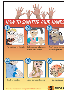
LIT-TSKCGS Kids How to Sanitize Your Hands, 5" x 7" Repositionable Cling- also fits into floor stand header