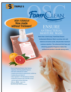
ENSURE Antibacterial Moisture Wash 1-sided sell sheet DIGITAL ONLY 8.5" x 11"