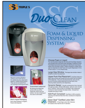
LIT-TSF (CS-306) SSS DuoClean Dispenser Brochure 2-sided sell sheet DIGITAL ONLY 8.5" x 11"