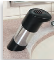
Black & Chrome 9930BLK