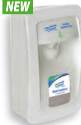
No Touch NS011WH33HS