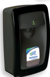
No Touch NS011BK31