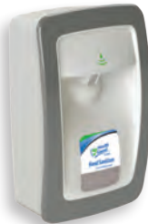
No Touch NS011WH32