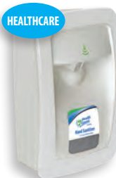
No Touch NS011WH33