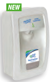
MS016WH33HS Health Guard Hand Sanitizer branded