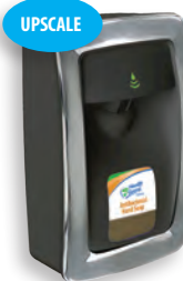
No Touch NS011BK34