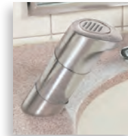
All Chrome 9930CHR

Available with a chrome finish – the most popular design choice for restrooms.