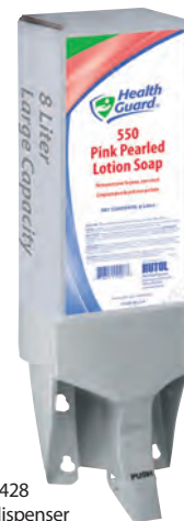
2428 With dispenser 9975ZPL