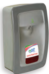
No Touch NS011GR32