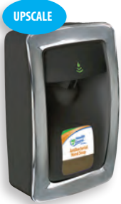
MS016BK34 (Additional Charge)