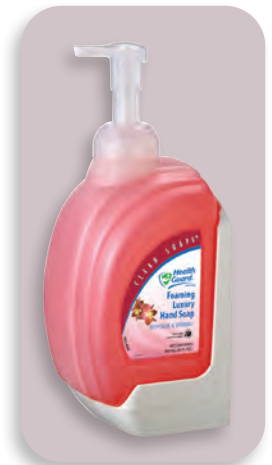
Shown with optional wall bracket 9907ZPL